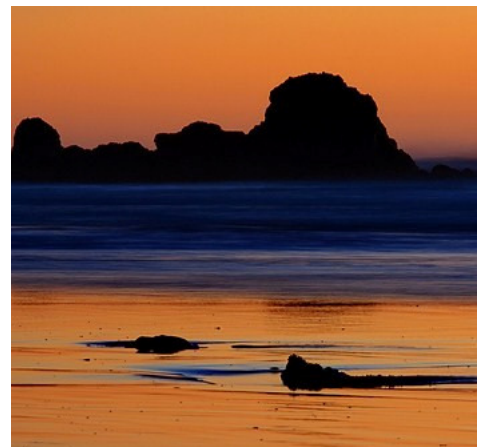
Highway 101 is a scenic byway covering 363 miles along the Oregon coast.