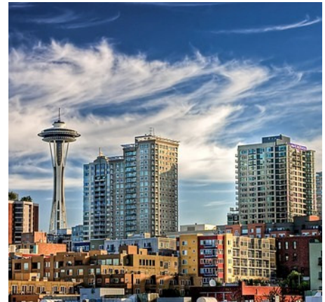
Summer is the best time to visit Seattle and the Pacific Northwest.

Washington State's Mt. Rainier National Park is stunning in the summertime, when its meadows are blanketed with colorful wildflowers. The scenic hiking trails at the park lead to cascading waterfalls, breathtaking views, and clear, calming streams. There is also ample camping, horseback riding, mountain biking, and fishing.