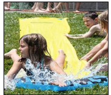
A summer staple for kids: Slip n Slide fun!