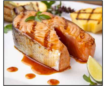
Grilled salmon teriyaki is a delicious, healthy alternative to the typical grilled fare.