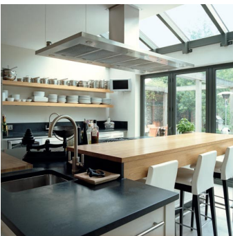
A well-appointed kitchen will enhance the value and enjoyment of your home.

The kitchen floor should be impervious to moisture. Concrete or tile floors are better than wood.