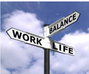
Keep track of the time you invest in your life roles to find the right balance.