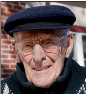
Seniors are more at risk during the winter.

They are from Dallas and supply parts for the oil and gas industry, like bearings, belts motors and other items. They have been great to deal with as well as Don McLeod, the landlord, to help make it happen.