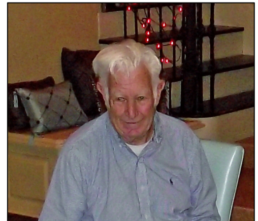
My dad is doing much better!

I think we will go back down to Nashville (not the famous Tennessee city) because it is a very quaint historic town. We were there on a weekday and it was packed like you would expect it to be on a weekend.