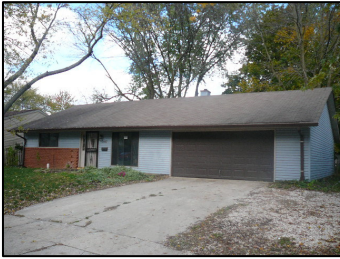
Wouldn't you buy this house for $21,000?