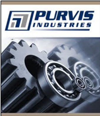
Purvis Industries moved in at McLeod Business Park.